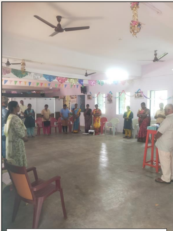
Prayer Song before the Meeting