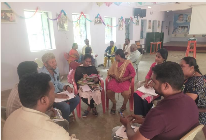
Group Discussion regarding the Child safeguarding Policy

The afternoon session was dedicated to group discussions on child safeguarding. Participants approached this with great enthusiasm, understanding the importance of acquiring certification in child protection. By the end of the session, all staff and volunteers successfully completed the training.